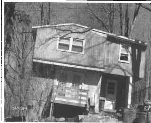
04/02/2014 File Photo

Town of Southeast 1360 Route 22 Brewster NY 10509