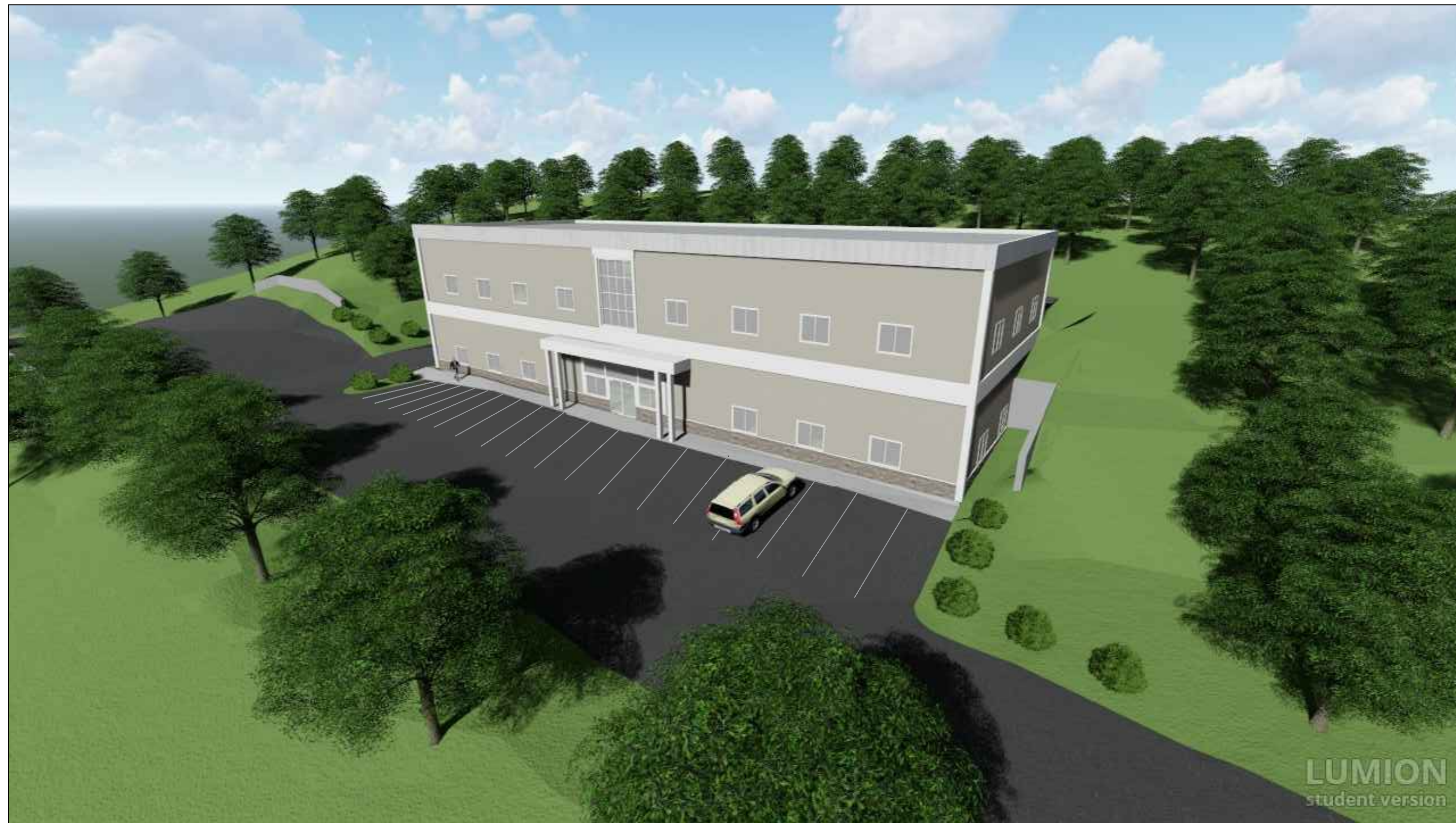
① FRONT VIEW – SOUTH