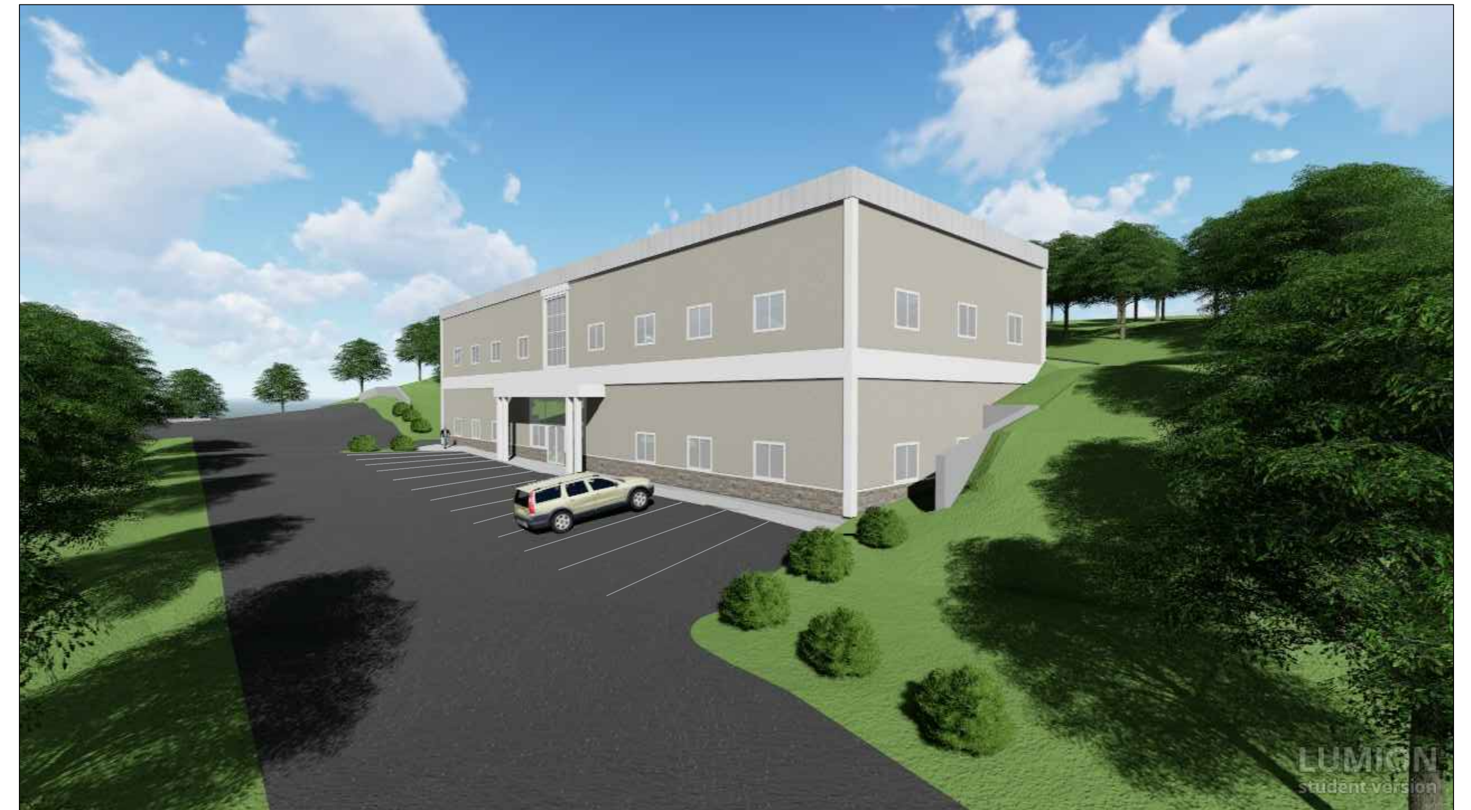
② FRONT VIEW – EAST