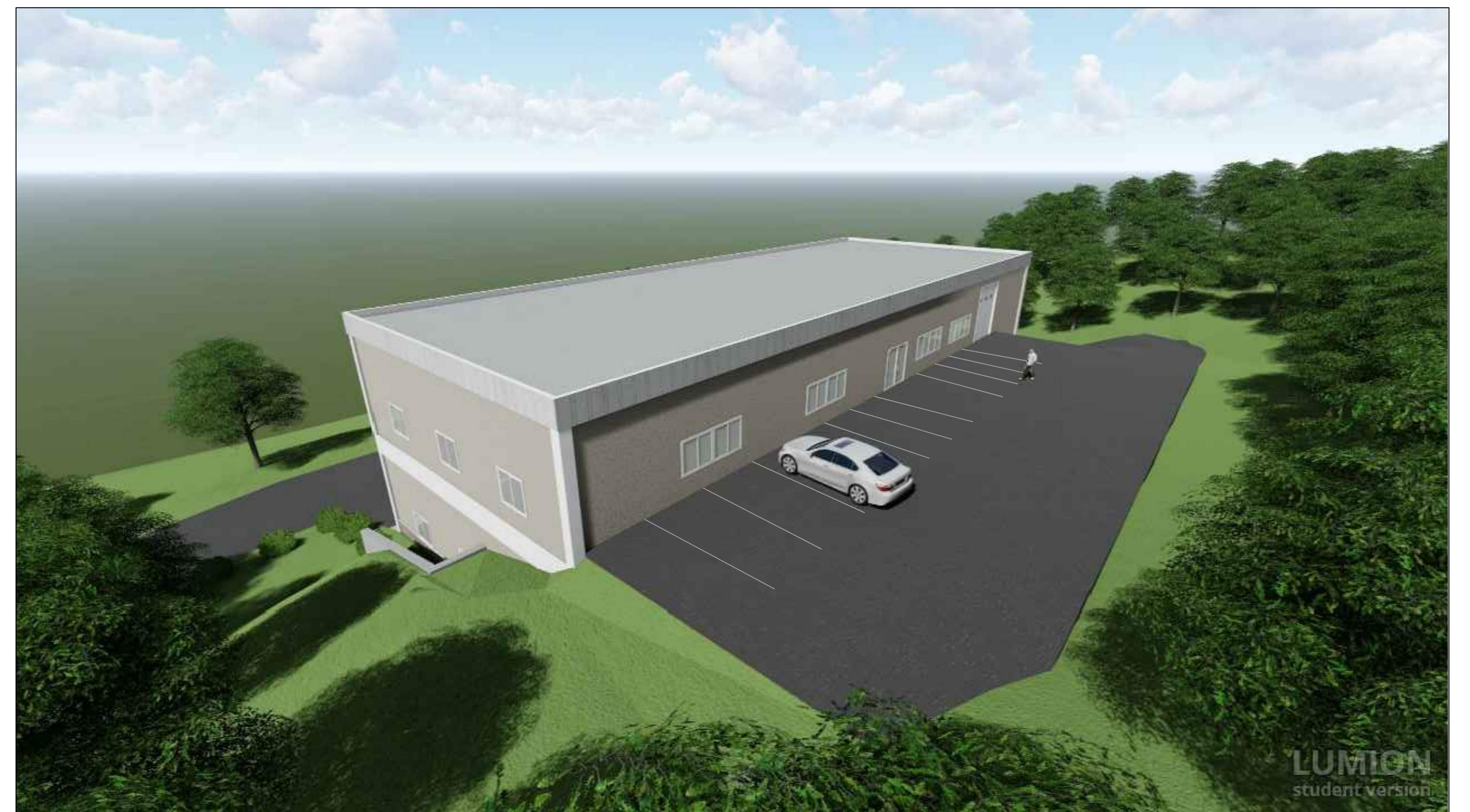
④ REAR VIEW