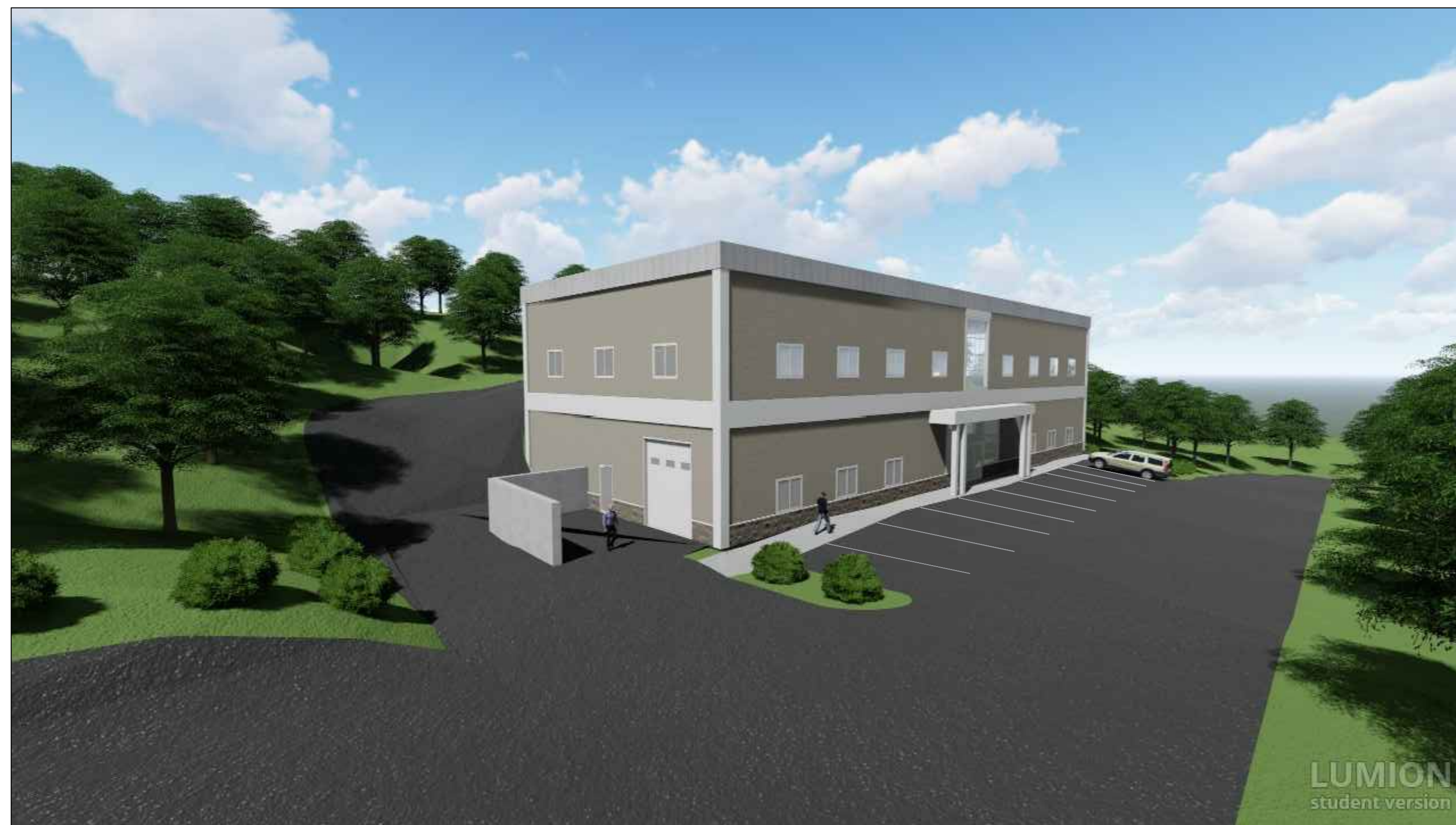
③ FRONT VIEW – WEST